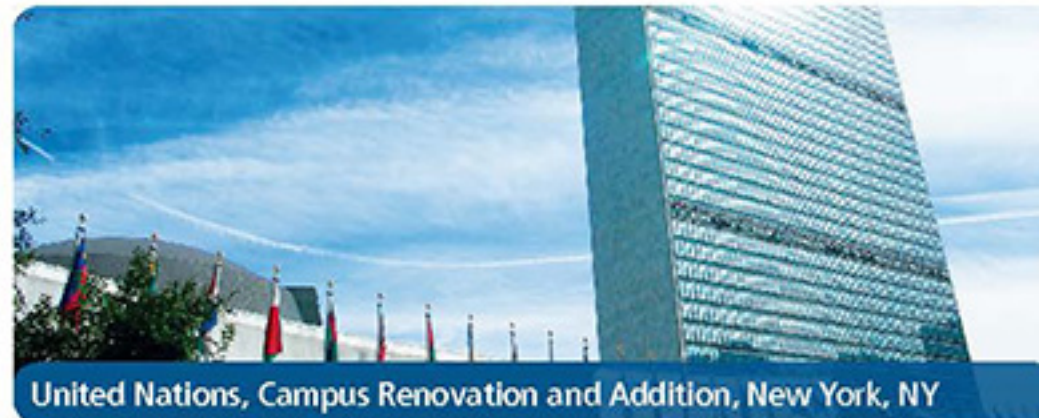
United Nations, Campus Renovation and Addition, New York, NY